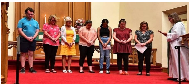
Sunday School Staff