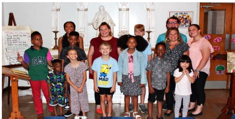
Sunday School Students